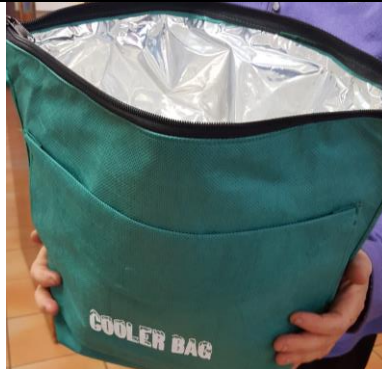
Cooler/ warmer Bag