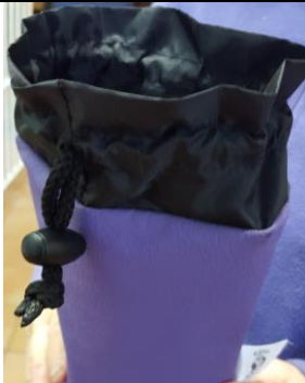
Water/ Wine bottle cooler/ warmer bag

A tip: If you keep your cooler bag in your car, it comes in handy when you do your shopping. When you buy frozen food or milk etc, place it in your cooler bag, make sure it is sealed, and continue with your shopping. Your food will remain frozen or very cold / or hot for hot food