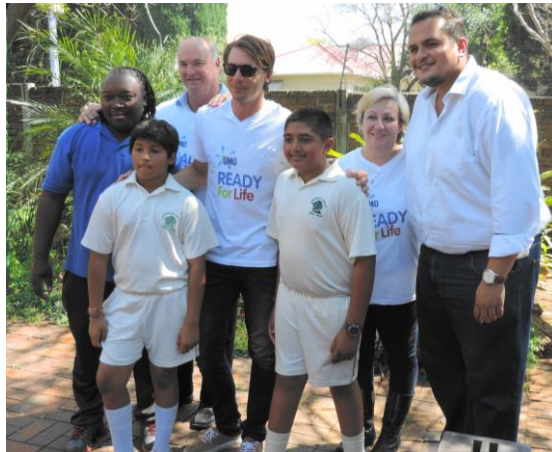
Learners with Coach, representatives from Omo & Dale